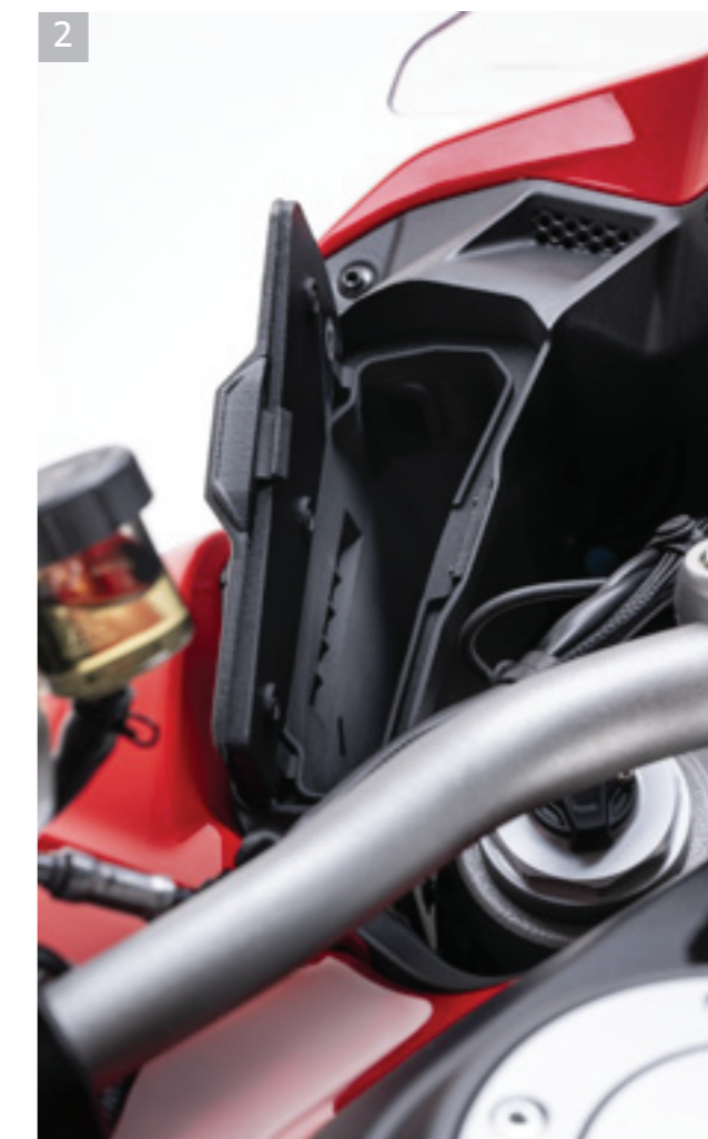
2 Usb compartment