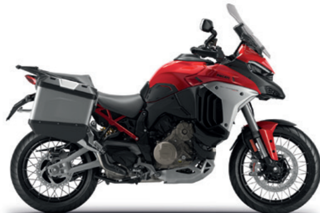
Adventure Travel & Radar

The Travel & Radar trim combines the Radar package with everything needed for travelling, namely aluminium cases and heated hand grips and saddle.