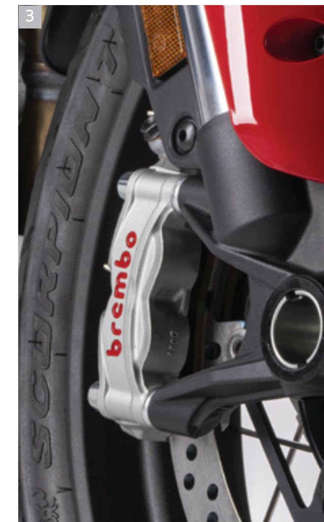
3 Brembo callipers Stylema