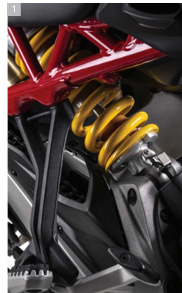
1 Adjustable monoshock