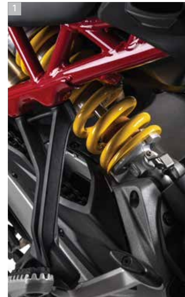
1 Adjustable monoshock