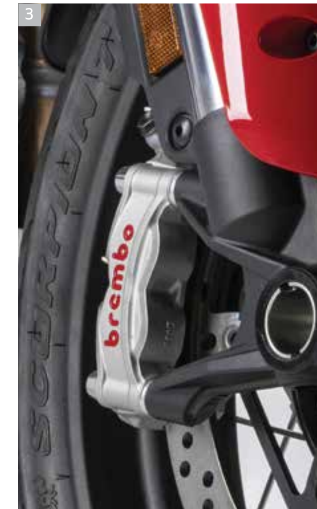
3 Brembo callipers Stylema