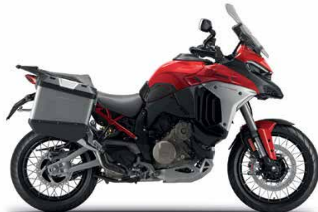
Adventure Travel & Radar

The Travel & Radar trim combines the Radar package with everything needed for travelling, namely aluminium cases and heated hand grips and saddle.