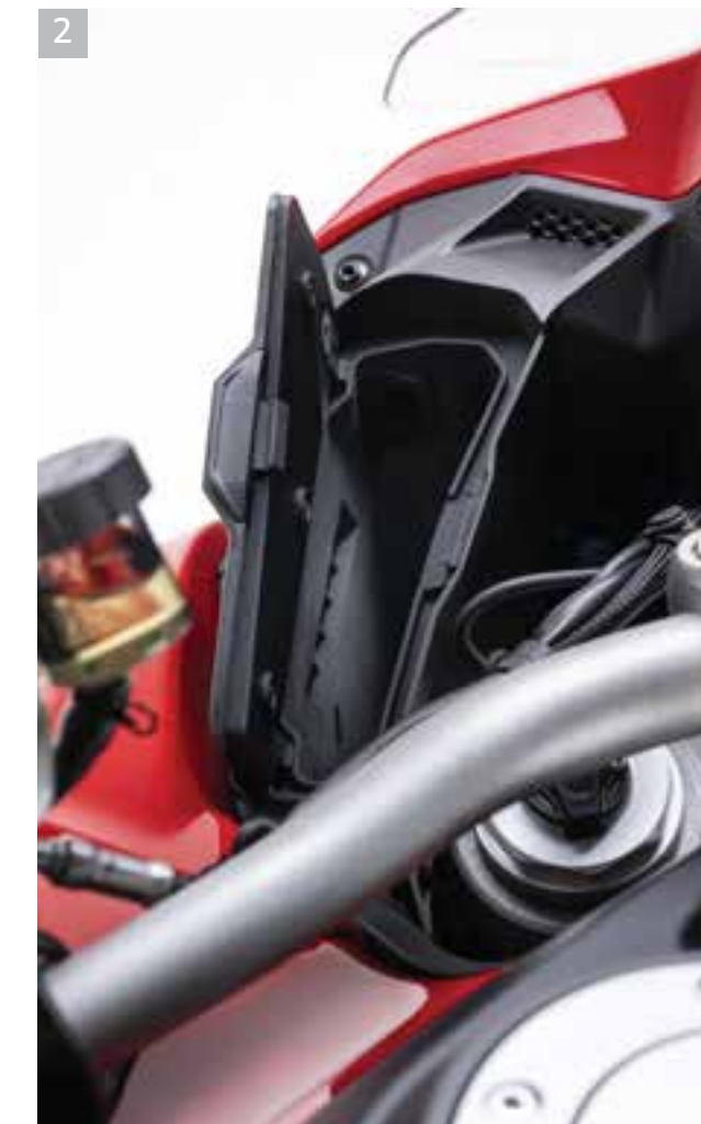
2 Usb compartment