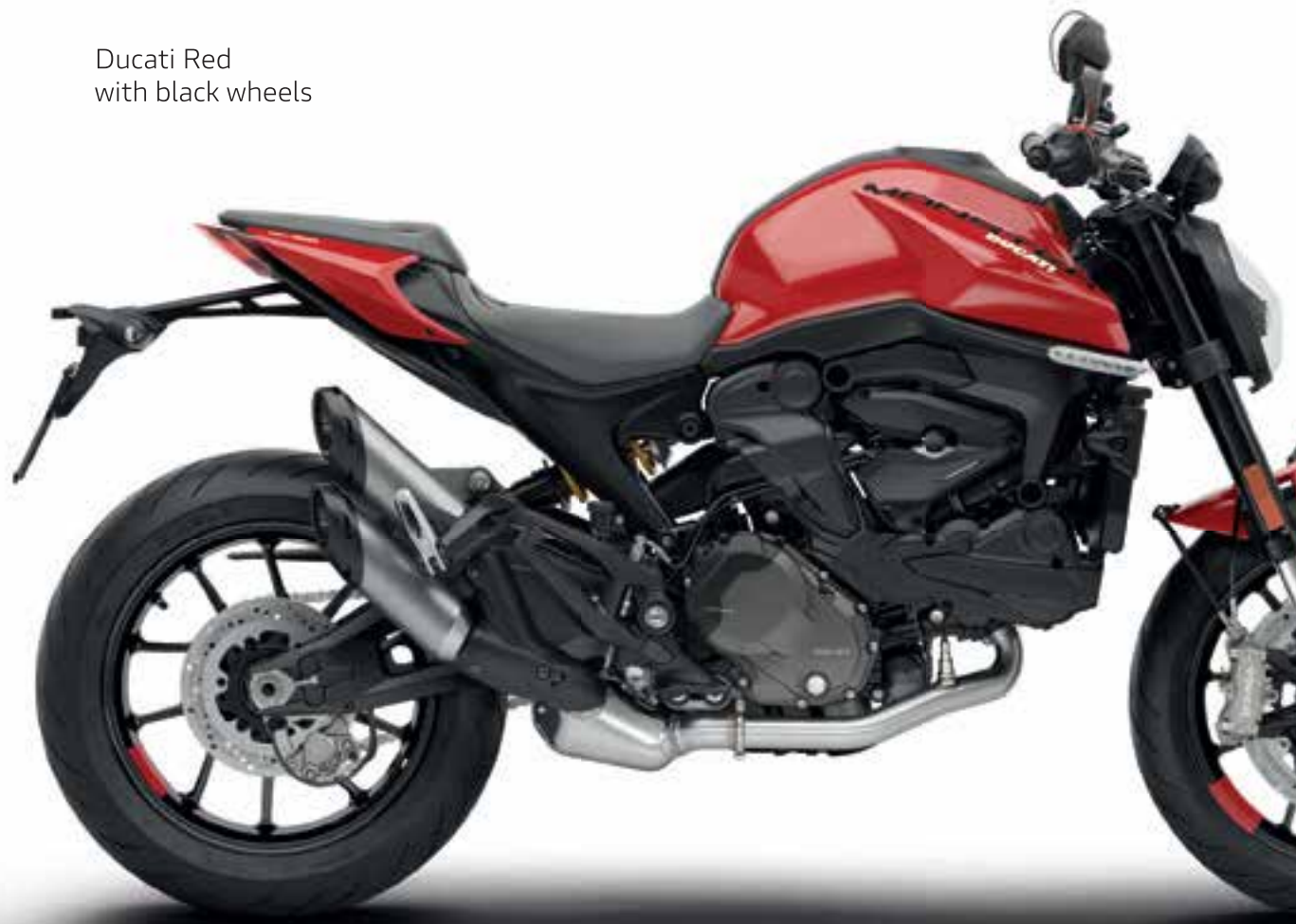
Ducati Red with black wheels