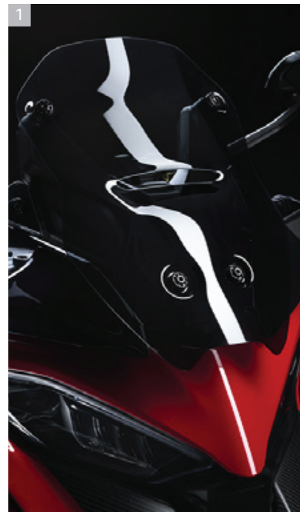
1 Low dark-smoked windshield