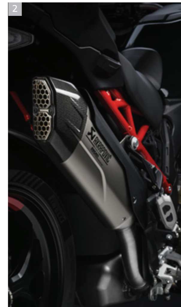
2 Type-approved Akrapovič exhaust system