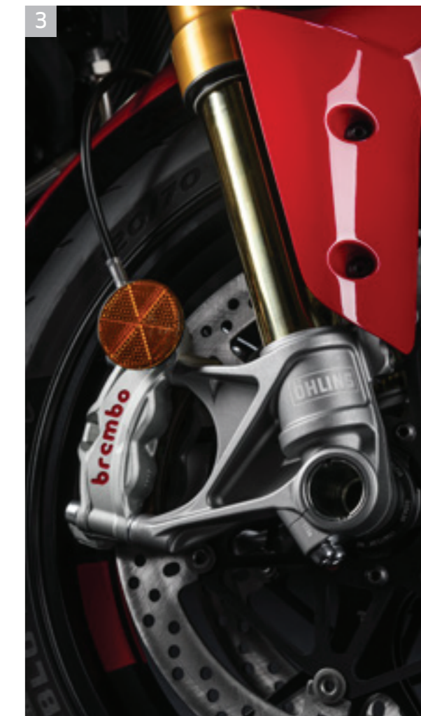
3 Electronic Öhlins Smart EC 2.0 suspension