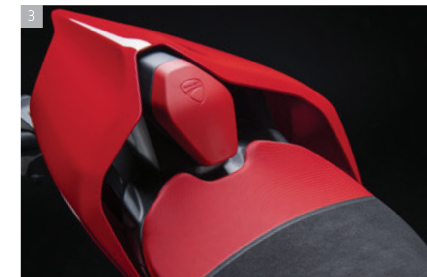
3 Two-tone seat in technical fabric