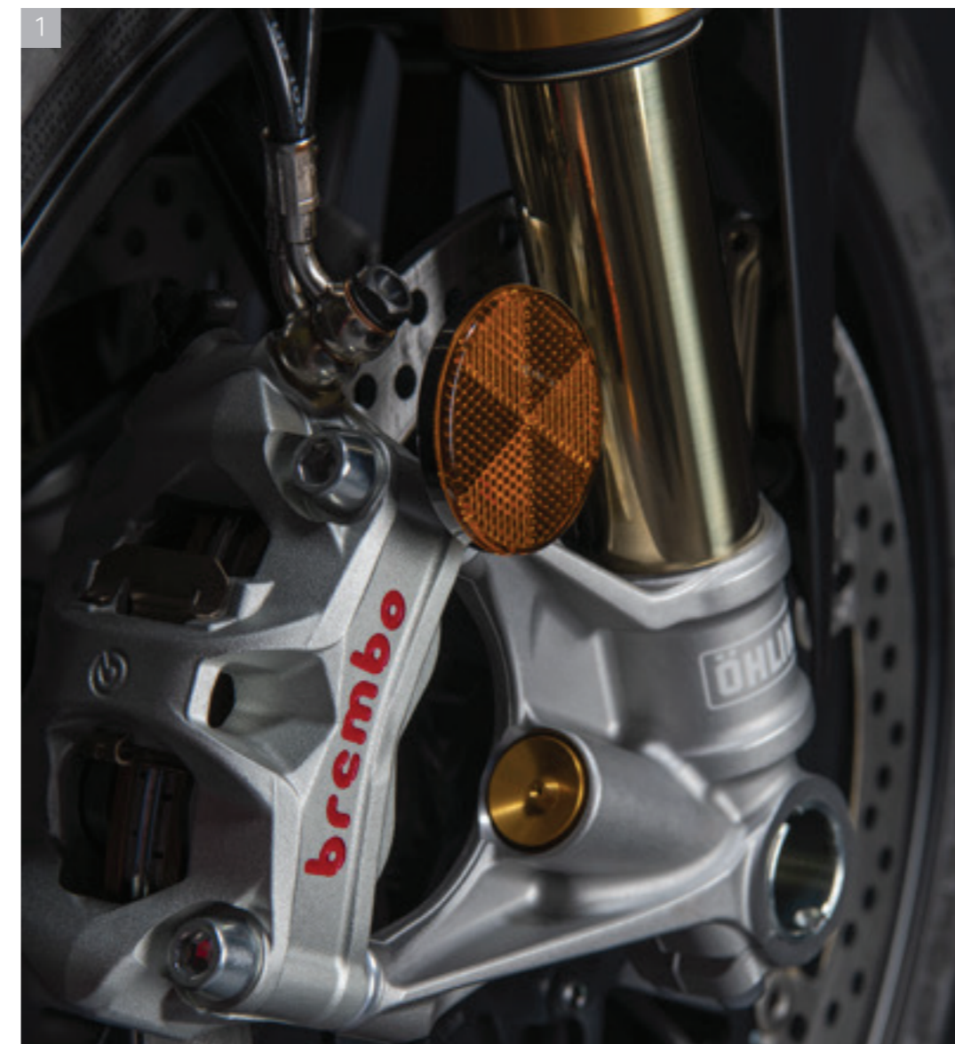
1 Öhlins 43 mm NPX25/30 pressurised fork