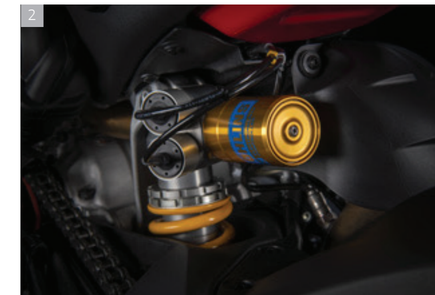
2 Öhlins TTX36 event based rear shock