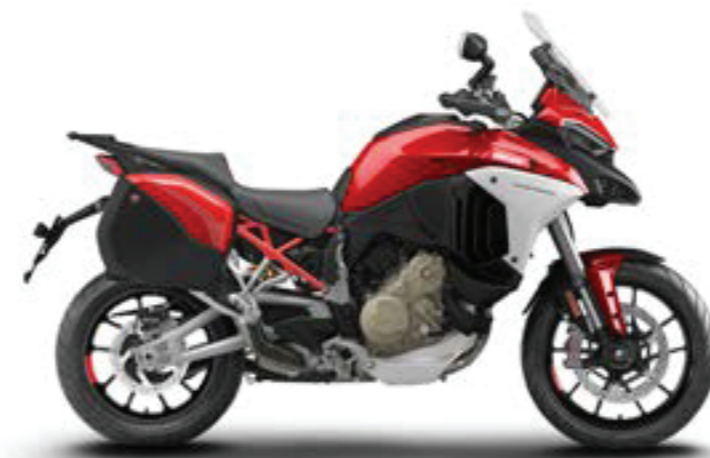
Travel & Radar

The Travel & Radar package includes the radar system together with everything needed to enjoy the journey and the long distances: rigid side panniers, a central stand, and heated handgrips and seats.