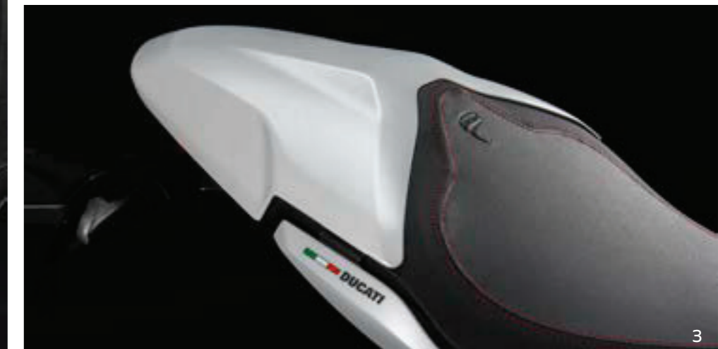
1_ Fully adjustable Ø 48 mm Öhlins fork with TiN treatment. 2_ Fully adjustable Öhlins monoshock with integrated gas tank. 3_ Passenger seat cover.